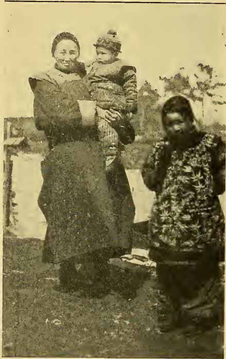
A CHINESE FAMILY

From this rapid review of Chinese thought upon this subject as